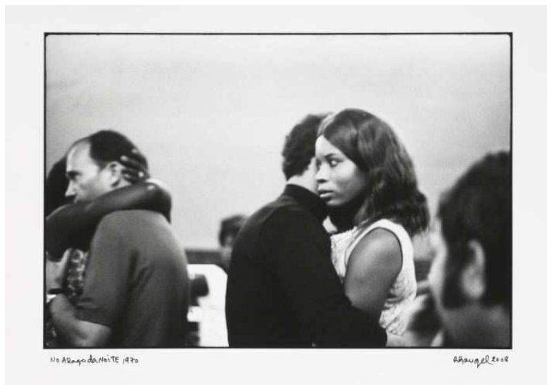
© Ricardo Rangel, In the embrace of the night, 1970.