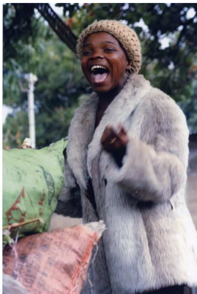
© Moshe Sekete, Untitled , 2007

The Market Photo Workshop is proud to announce that the highly acclaimed exhibition, I am not afraid. The Market Photo Workshop, Johannesburg will open at the Leitung Aspekte Galerie at the Münchner Volkshochschule in Munich, Germany, on 5 March 2009.