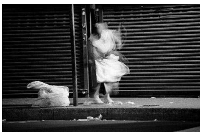
© Sabelo Mlangeni, Invisible Woman 1 , 2006