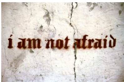
© Nontsikelelo Veleko, I am not afraid , Louis Botha Ave, Johannesburg, 2002

Exhibition opens at the Leitung Aspekte Galerie in Munich on 5 March 2009